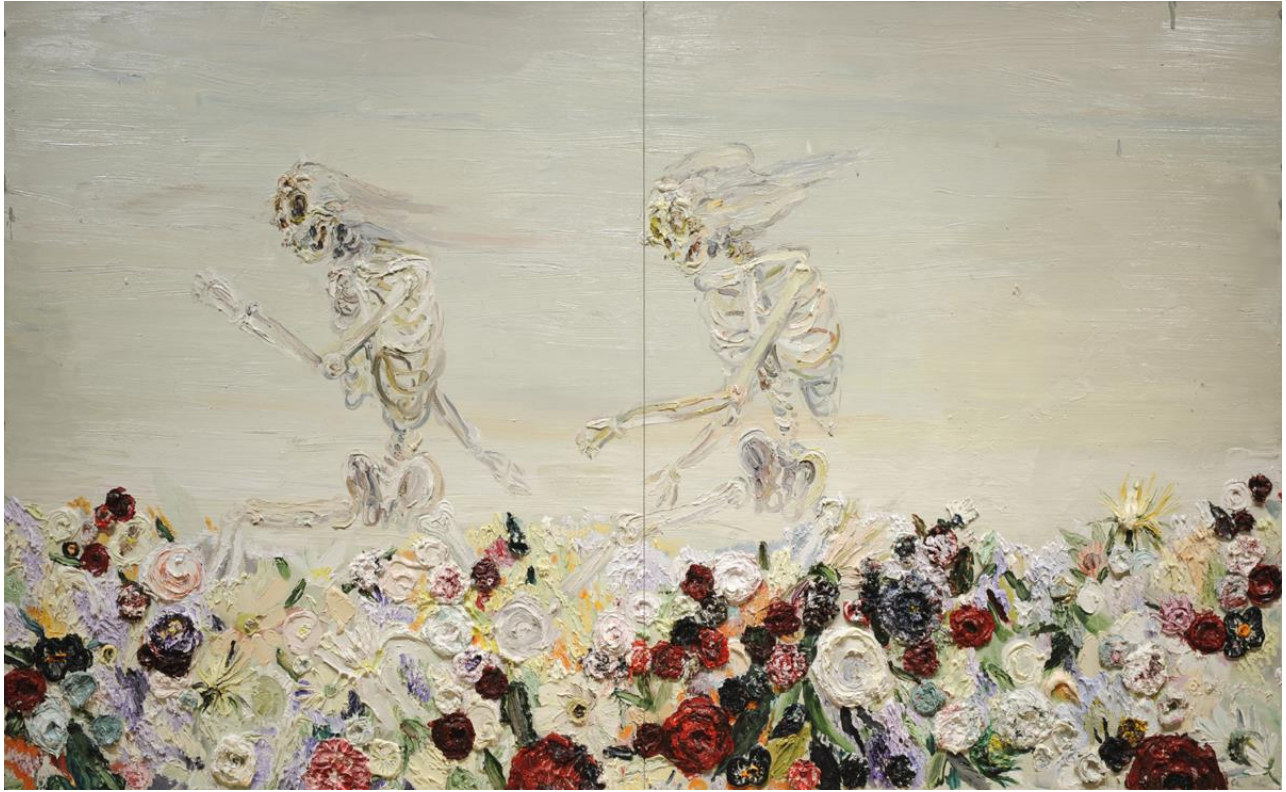
Allison Schulnik (American, b. 1978) Skipping Skeletons , 2008 Oil on canvas Collection Nerman Museum of Contemporary Art, 2014.17