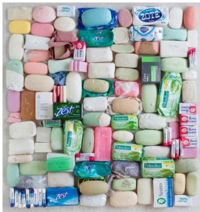
Tom Kiefer (American, b. 1959) Water Bottles , 2016 Polo Shirts , 2016 Gloves , 2016 Soap , 2016 Archival inkjet prints All LOANS courtesy the artist