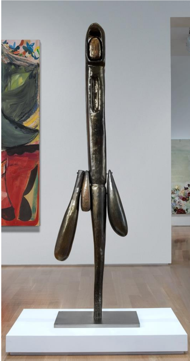
Louise Bourgeois (French American, b. 1911-d. 2010) Woman with Packages , 1949 (cast 1996) Bronze, no. 6/6 Collection Nerman Museum of Contemporary Art, 1996.02 Gift of Marti and Tony Oppenheimer and the Jules and Doris Stein Foundation