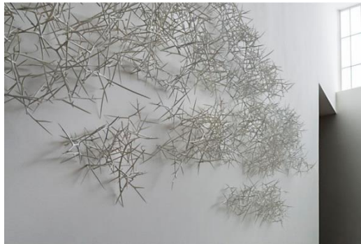
Daum Museum Installation, 2015, Floating Between the Real and the Ideal