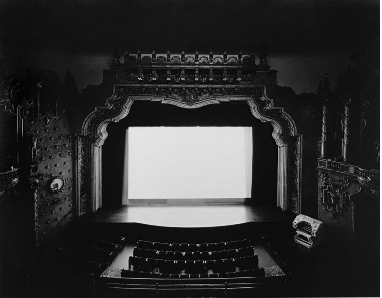
Hiroshi Sugimoto (Japanese, b. 1948) Carpenter Center , 1993 Gelatin silver print Collection Nerman Museum of Contemporary Art