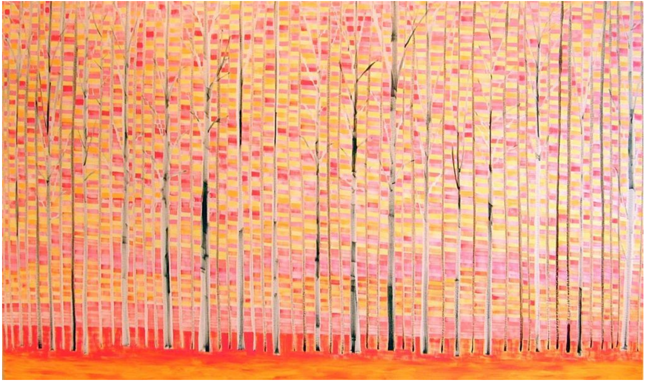
Benjamin Butler (American, b.1975) Fifty-five Trees at Sunset , 2006 Oil on canvas Collection Nerman Museum of Contemporary Art, 2006.24