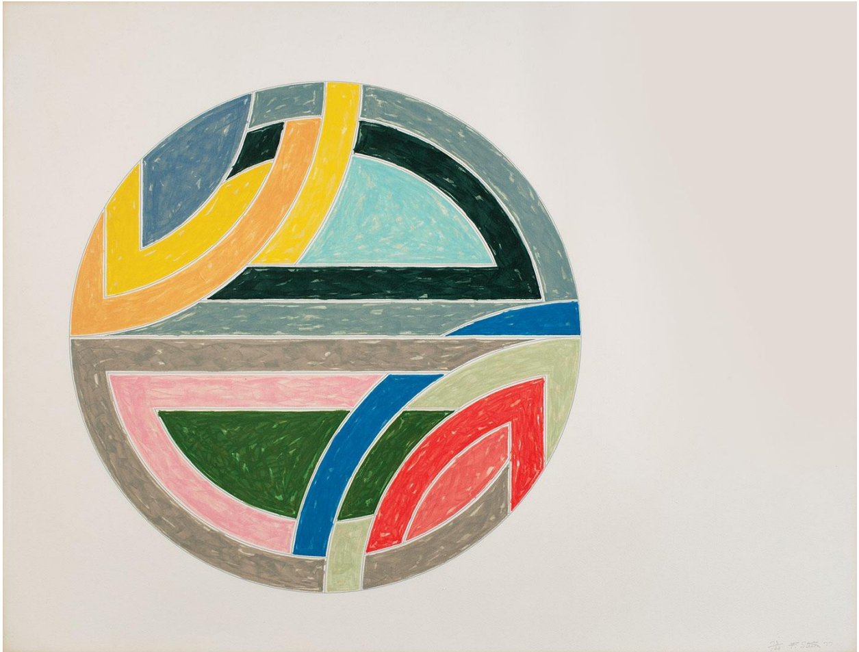
Frank Stella (American, b. 1936) Sinjerli Variation IIa , 1977 Lithograph and screenprint Collection Nerman Museum of Contemporary Art, 1997.06 Gift of Marti and Tony Oppenheimer