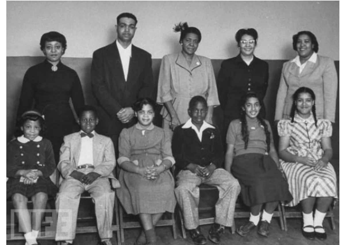
"The plaintiffs of Brown v. Board and their children," 1953